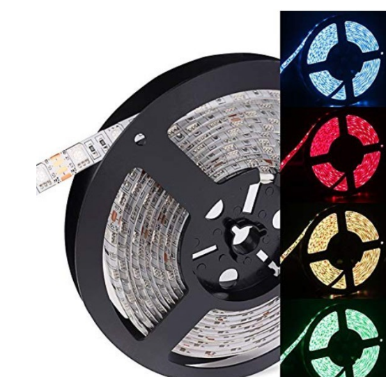
Waterproof LED tape